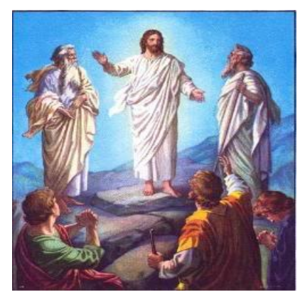
February 28 2021